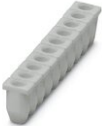
Insulating sleeve, color: gray

Please be informed that the data shown in this PDF Document is generated from our Online Catalog. Please find the complete data in the user's documentation. Our General Terms of Use for Downloads are valid ( http://phoenixcontact.com/download )